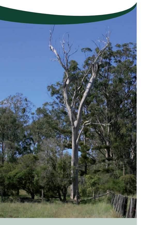
This dead tree provides nesting sites for Dollarbirds and Galahs, as well as perching and shelter sites for a host of other animals.

The age at which trees develop hollows varies widely, however, large hollows are typically associated with trees that are at least 100 years old. As a general rule as a tree becomes older, it develops more and larger hollows. Bushland areas in good condition typically have 3-10 hollow-bearing trees per hectare, each containing as many as 30 hollows of varying sizes and supporting a diverse wildlife population.