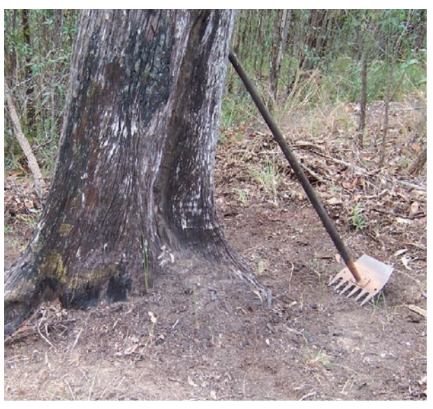
Fire rakes can be used to rake leaf litter away from the base of habitat trees prior to undertaking a prescribed burn.

Gibbons P & Lindermayer DB (2002) Tree Hollows and Wildlife Conservation in Australia . CSIRO Publishing, Melbourne.