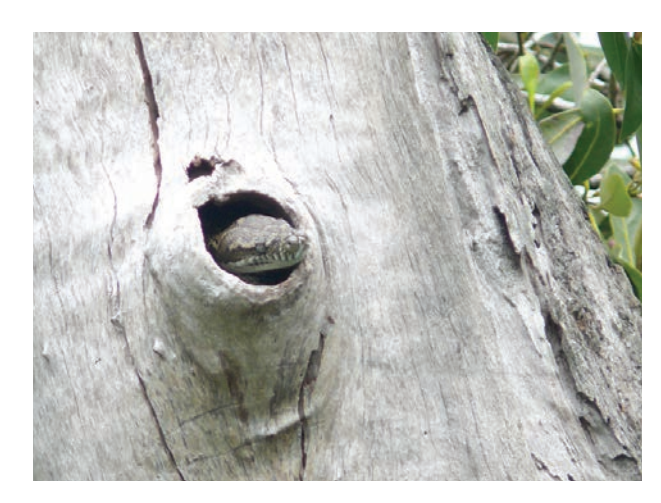
Hollows are used by a wide range of animals such as this Carpet Python. There are over 130 species of wildlife that are dependent on hollows for their survival in South East Queensland alone.

Land for Wildlife is a voluntary program that encourages and assists landholders to provide habitat for wildlife on their properties. For more information about Land for Wildlife South East Queensland, or to download Land for Wildlife Notes free of charge, visit www.lfwseq.com.au Citation: Land for Wildlife Queensland (2011) Note V7: The Value of Habitat Trees .