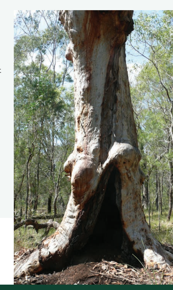
Note V7: The Value of Habitat Trees

Habitat trees that have a large hollow core may offer a protected place for micro-bats to breed and to roost during the day.