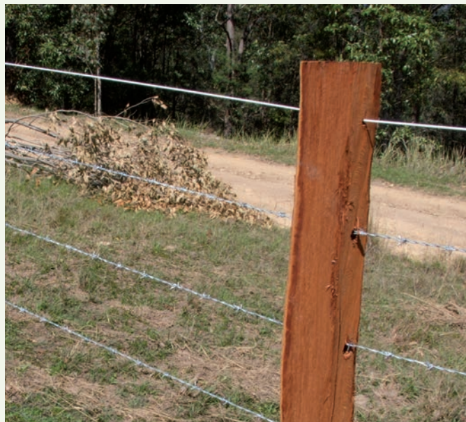
A top strand of plain wire or borderline (as shown) will help reduce wildlife entanglements and is strongly recommended in high risk sites such as around dams, on flight paths and along ridgelines. Borderline is a high-tension nylon wire that is both strong and highly visible.

There are less harmful alternatives available, including nets of white knitted materials, which is more visible to wildlife. This netting must be pulled tight over a frame surrounding the tree or trees, so that wildlife 'bounce' off it rather than getting entangled. It is also important to check your netting daily for entangled wildlife.