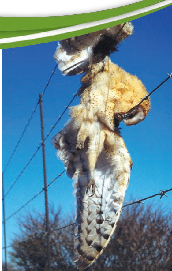
A Barn Owl caught on a barbed wire fence.