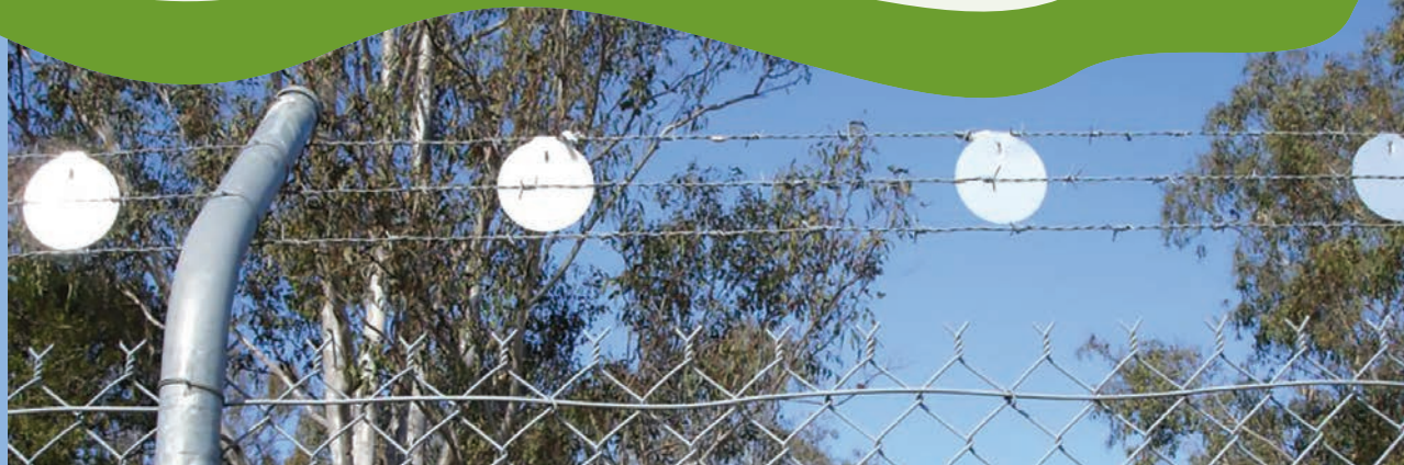
Reflective metal tags can be attached to barbed wire to minimise wildlife entanglements.

Fence spacing. Fences can be modified to allow enough space underneath the lowest fence strand, which will assist the movement of ground-living wildlife such as kangaroos, wallabies and bettongs. A 50 cm gap between the ground and lowest fence strand is recommended.