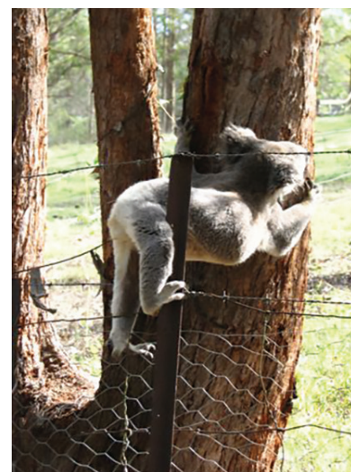
A Koala climbing through a fence at Mount Cotton demonstrates the difficulties wildlife face with some fencing.

Land for Wildlife is a voluntary program that encourages and assists landholders to provide habitat for wildlife on their properties. For more information about Land for Wildlife South East Queensland, or to download Land for Wildlife Notes free of charge, visit www.lfwseq.com.au