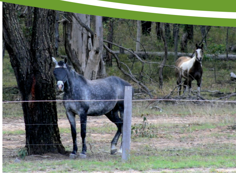
A simple hardwood post and three strand plain wire fence is friendly to both wildlife and domestic animals.