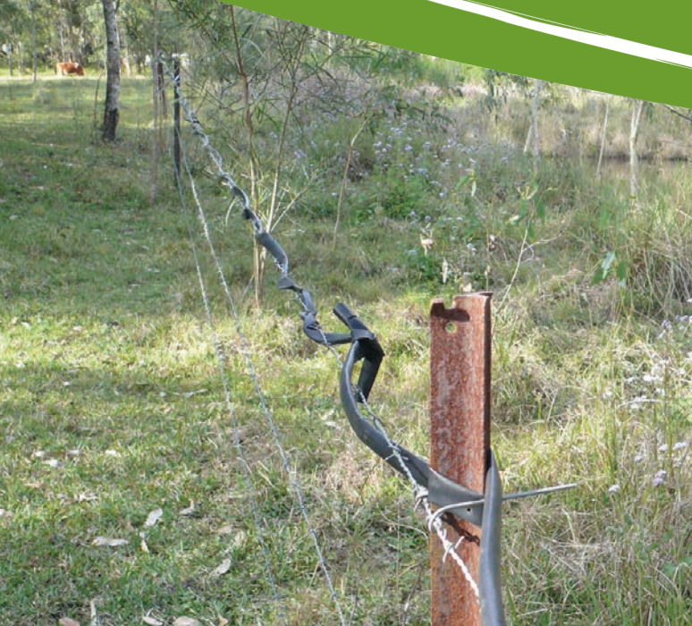
Wrapping old irrigation polypipe around the top strand of a barbed wire fence can help reduce wildlife entanglements, especially in high risk areas such as around this dam.