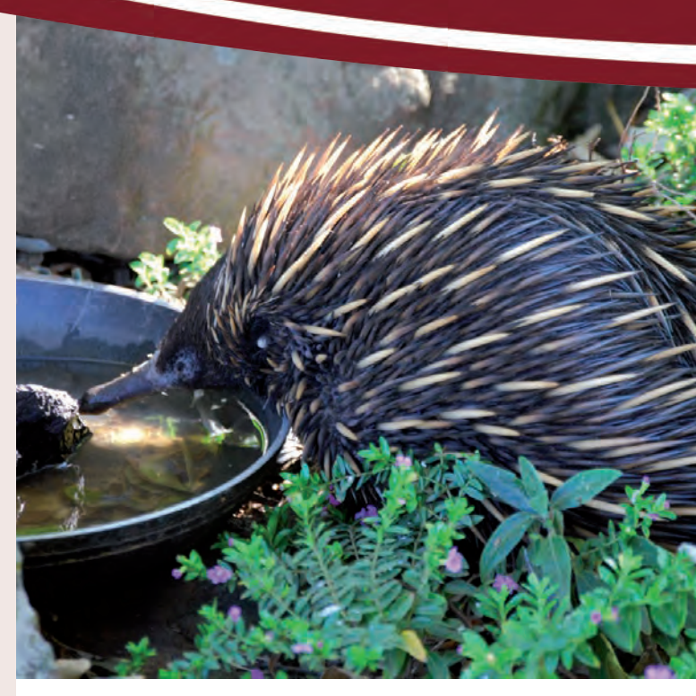
Echidnas will seek out water during hot weather.

Adult echidnas vary in size and weight but are usually between 30-45~cm in length with the males weighing about 6 kg and females about 4.5 kg.