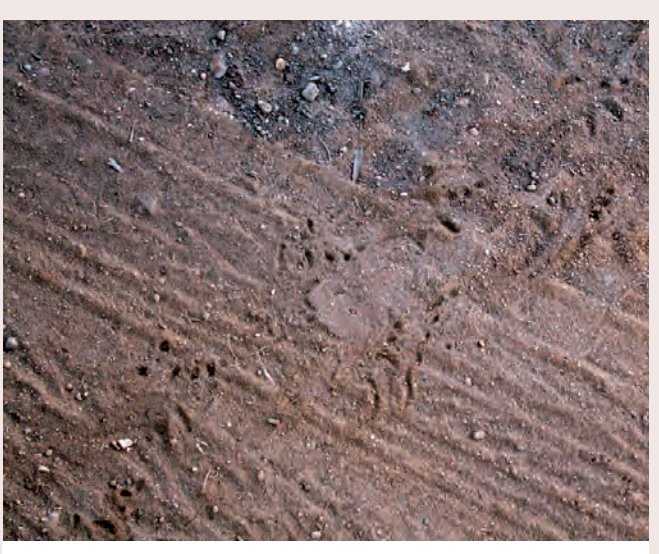
Keep an eye open for distinctive echidna tracks in sandy areas.

Wildlife Preservation Society of Queensland www.wildlife.org.au/wildlife/speciesprofile/mammals