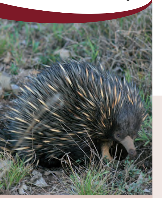
Echidnas can sometimes be seen in relatively open areas.

Short-beaked Echidnas have a unique appearance, with their backs and sides covered in stout, sharp spines amongst a fur coat of light brown to black. Echidnas have a long snout, which they use to search for food, smell for predators and to find other echidnas. The Latin, Tachyglossus , means 'quick tongue', referring to the speed with which the echidna uses its tongue to