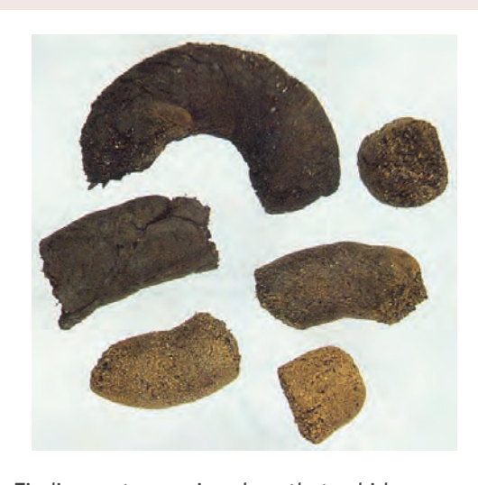
Finding scats can give clues that echidnas are on your property. Image reproduced with permission from Tracks, Scats and Other Traces (2004) by Barbara Triggs.

Land for Wildlife is a voluntary program that encourages and assists landholders to provide habitat for wildlife on their properties. For more information about Land for Wildlife South East Queensland, or to download Land for Wildlife Notes free of charge, visit www.lfwseq.com.au Citation: Land for Wildlife Queensland (2011) Note A6: Short-beaked Echidnas .