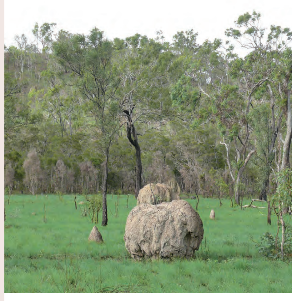
Echidnas take advantage of concentrated food sources such as ant nests and termite mounds.