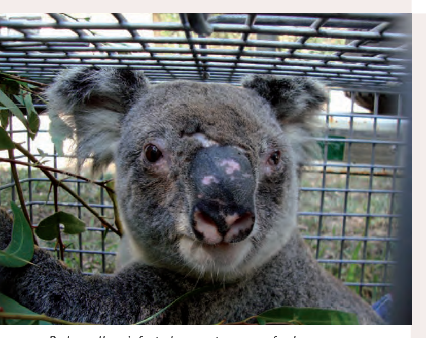
Red, swollen, infected or crusty eyes or fur loss around eyes, face or body are all signs of a sick Koala.