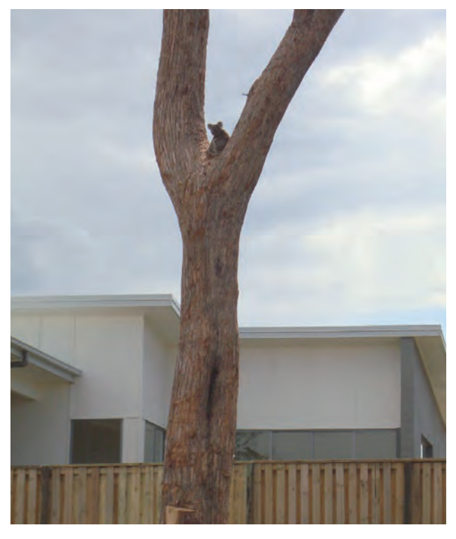
Urban encroachment is a major contributor to habitat loss and threatens Koala survival in South East Queensland.

Land for Wildlife is a voluntary program that encourages and assists landholders to provide habitat for wildlife on their properties. For more information about Land for Wildlife South East Queensland, or to download Land for Wildlife Notes free of charge, visit www.lfwseq.com.au Citation: Land for Wildlife Queensland (2011) Note A4: Koalas .