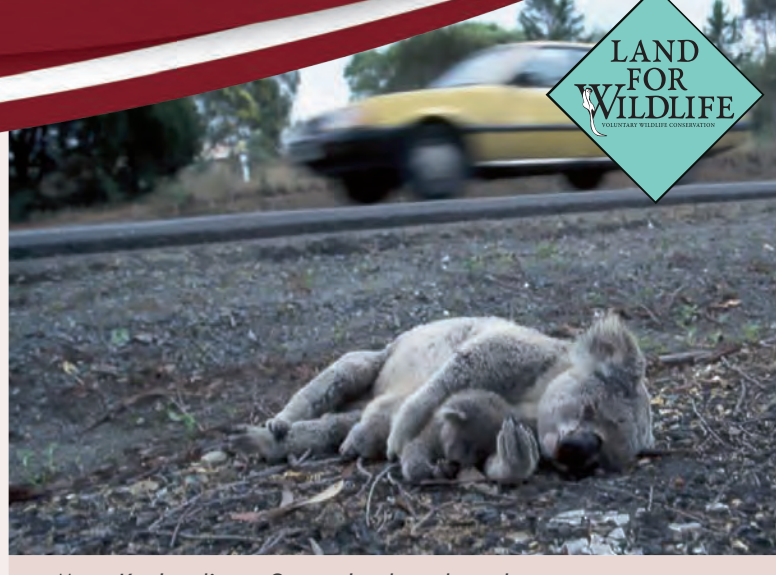
Many Koalas die on Queensland roads each year.