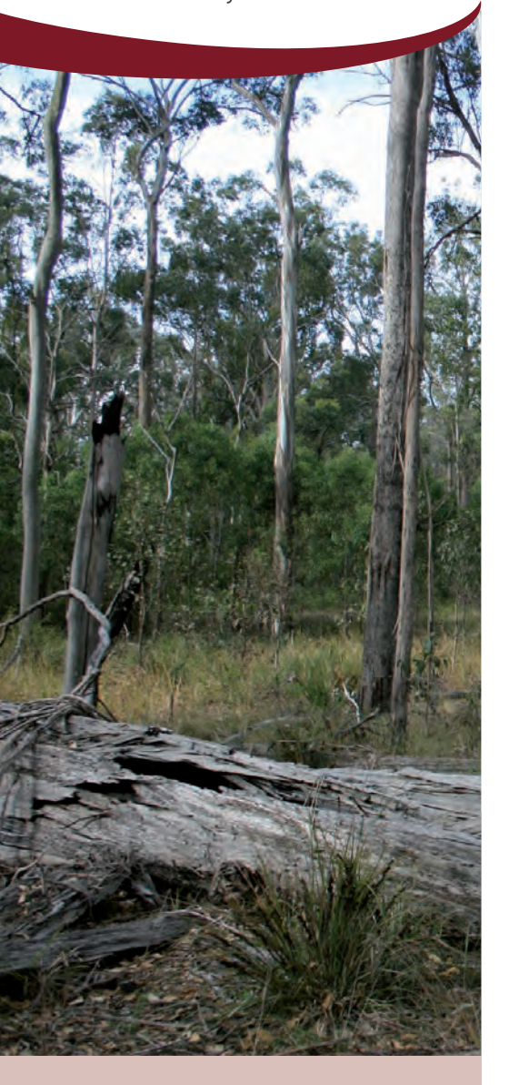
Open eucalypt woodland can provide suitable habitat for Koalas.

W ith the rapid rate of development, infrastructure and population growth in South East Queensland (SEQ) over the last few decades, Koalas and their habitat have severely declined.