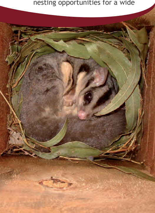
Squirrel Gliders in a nest box. The size and variability of hollow users is an important consideration.

The same tree hollow may be used by several species at different times of the year, and one animal may use several hollows in its lifetime. Hollows are an essential part of habitat requirements for many species of wildlife.