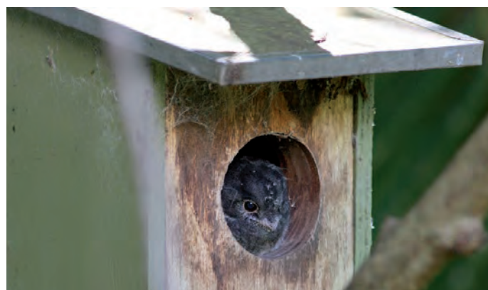
Owlet Nightjars and other nocturnal birds will utilise nest boxes.