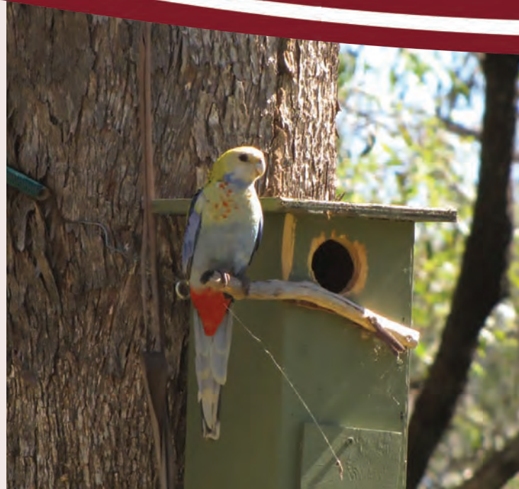
A Pale-headed Rosella using a home-made nest box on a Land for Wildlife property.

You can target certain animals by purchasing or making nest boxes of specific dimensions. Check your nest box regularly to see what wildlife is using it; however, take care not to disturb any inhabitants.