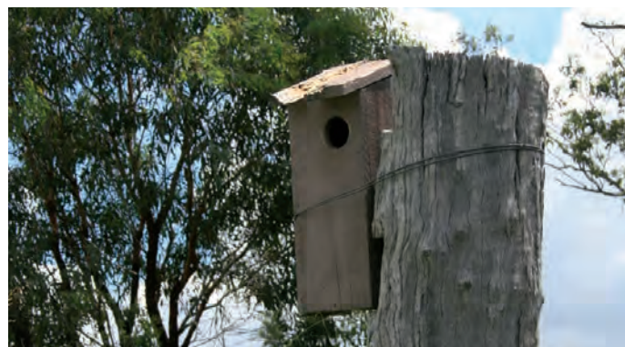
This nest box mounted on a tall old post has been used by Pale-headed Rosellas and Red-rumped Parrots.

www.birdsaustralia.com.au/resources/info-sheets.html (technical information on nest boxes).