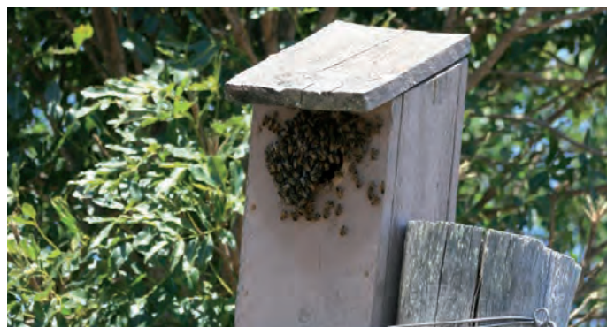
Nest boxes need to be monitored for the presence of unwelcome guests such as feral European Honeybees.

Land for Wildlife is a voluntary program that encourages and assists landholders to provide habitat for wildlife on their properties. For more information about Land for Wildlife South East Queensland, or to download Land for Wildlife Notes free of charge, visit www.lfwseq.com.au