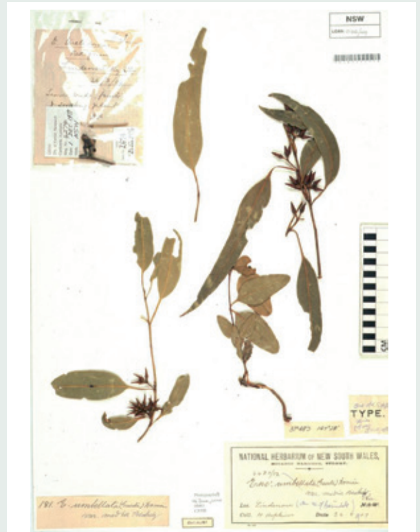
Type specimen of Eucalyptus tereticornis .

Botanical Information and Advisory Service Queensland Herbarium Brisbane Botanic Gardens, Mt Coot-tha Rd Toowong QLD 4066