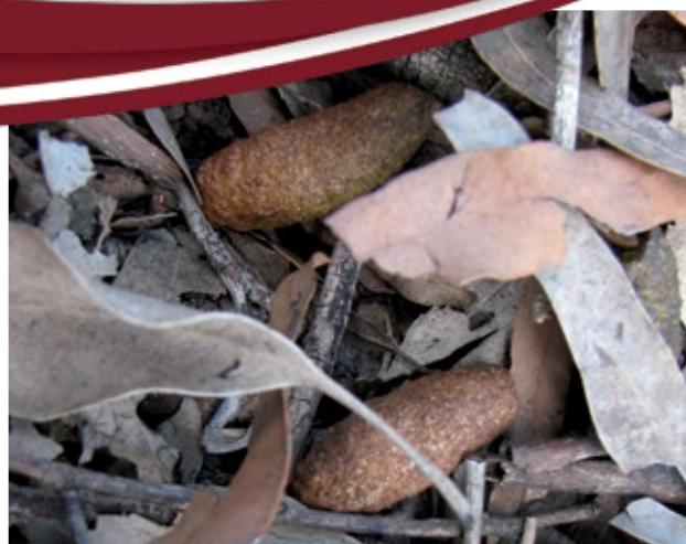
Koala scats have a distinctive shape and smell strongly of eucalyptus if broken.

www.thekoala.com/koala (excellent reference with information compiled from a number of sources).