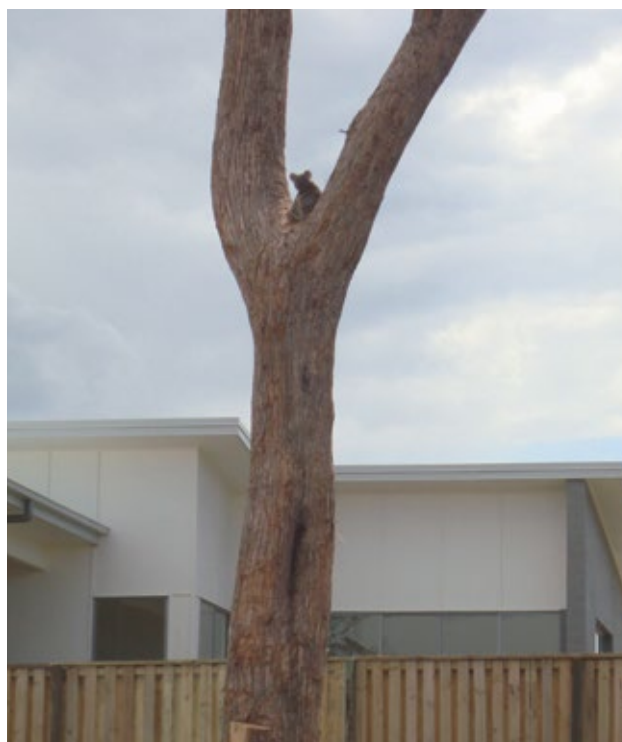
Urban encroachment is a major contributor to habitat loss and threatens Koala survival in South East Queensland.

Land for Wildlife is a voluntary program that encourages and assists landholders to provide habitat for wildlife on their properties. For more information about Land for Wildlife South East Queensland, or to download Land for Wildlife Notes free of charge, visit www.lfwseq.com.au