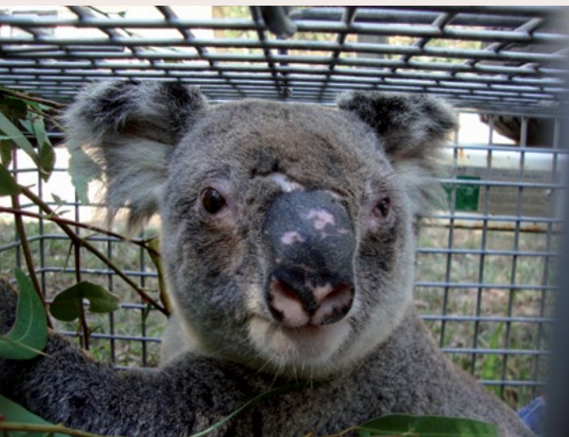
Red, swollen, infected or crusty eyes or fur loss around eyes, face or body are all signs of a sick Koala.