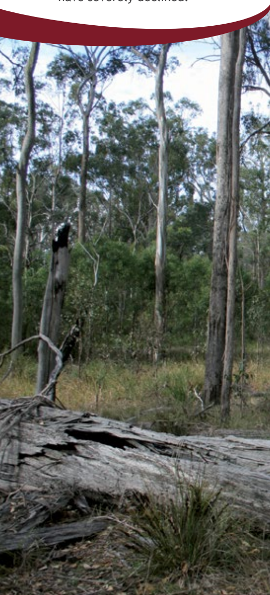
Open eucalypt woodland can provide suitable habitat for Koalas.

With the rapid rate of development, infrastructure and population growth in South East Queensland (SEQ) over the last few decades, Koalas and their habitat have severely declined.