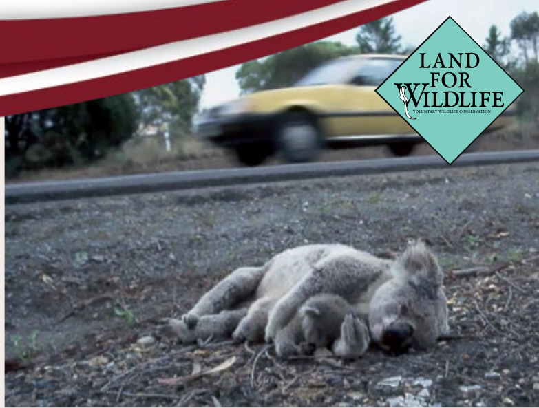
Many Koalas die on Queensland roads each year.