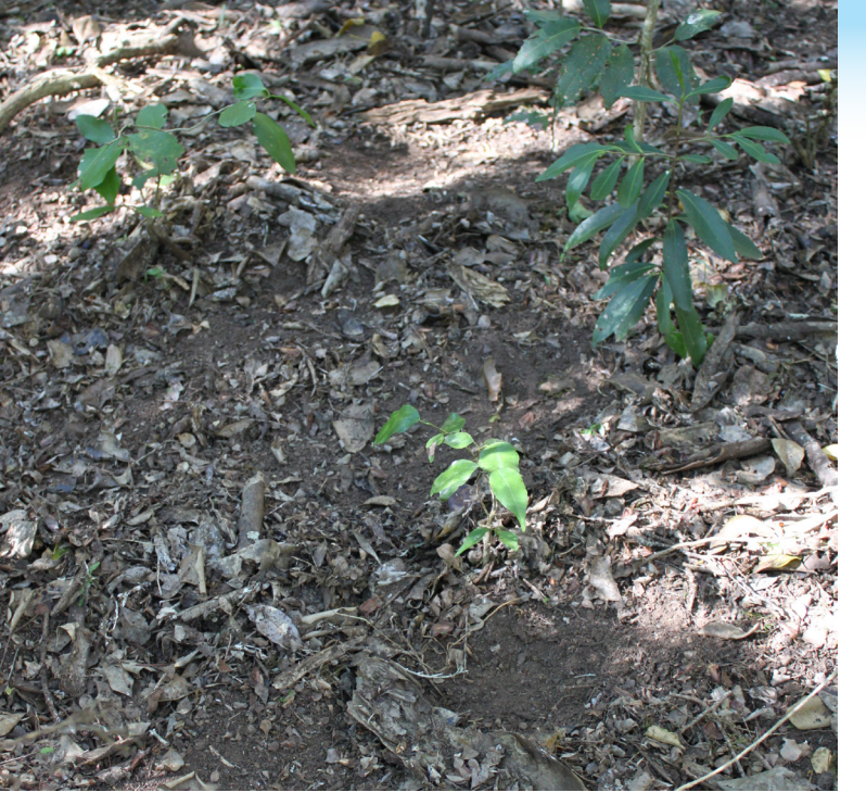
These round scratchings, called 'platelets', indicate the presence of button quails, which are small ground dwelling birds. There are several different button quail species in SEQ.