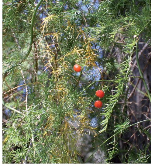
Climbing Asparagus (Asparagus africanus) can form severe infestations in Brigalow, eventually smothering the canopy, and killing the host trees (left). It is important to remain vigilant even post initial treatment of this weed, as the small red seeds (above) are favoured by birds and can quickly re-infest a regenerating patch without regular inspections.