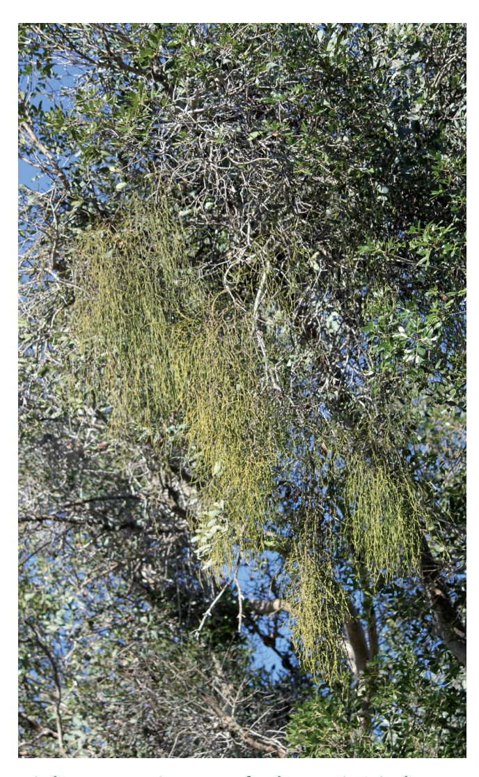
Mistletoes are an important food source in Brigalow scrubs for many bird and bat species.