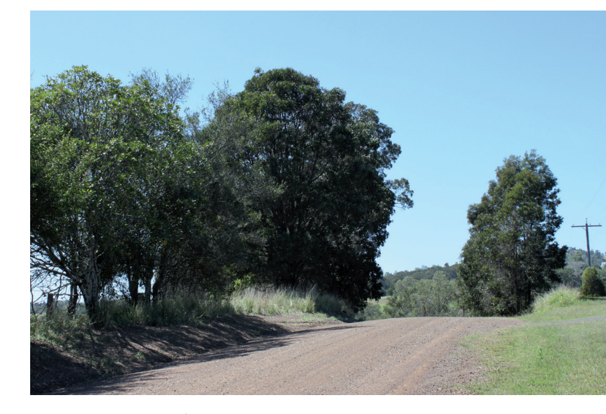
A roadside patch of Brigalow in the Lockyer Valley.

RE 12.8.23 Brigalow Scrub will often co-occur with RE 12.8.21 semi-evergreen vine thicket. Over time, transitional patches with mature Brigalow and an established understorey of scrub species (right), may transition entirely to RE 12.8.21. A dominant understorey of scrub species may prevent young Brigalow plants from establishing, causing Brigalow to gradually disappear as the old trees die and are not replaced.