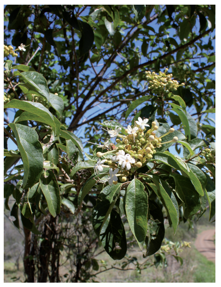
Lolly Bush (Clerodendrum floribundum).