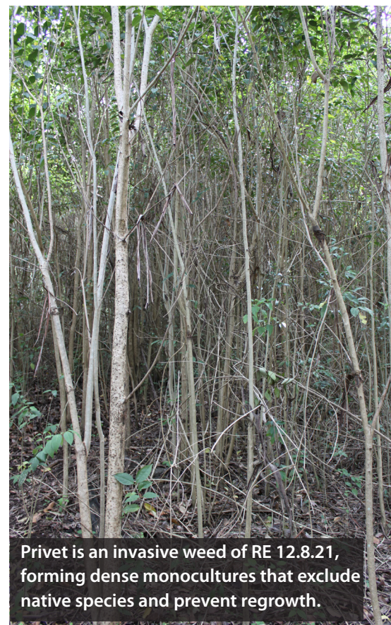
Privet is an invasive weed of RE 12.8.21, forming dense monocultures that exclude native species and prevent regrowth.