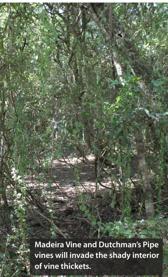
Madeira Vine and Dutchman's Pipe vines will invade the shady interior of vine thickets.

The introduced pasture grass Green Panic ( Megathyrsus maximus ) is a prolific seed regenerator which establishes in semi-shade along the margins of semi-evergreen vine thickets. It becomes highly flammable when dry and increases the risk of damage from fire. Fire normally burns to the edge of vine thicket patches under moist or cool conditions. However, under dry conditions fires will burn some distance into softwood scrub and can creep through the leaf litter on the forest floor. While some edge species will sucker, fire usually causes a great deal of stem death and damage. Fire also promotes weed invasion by Lantana, Green Panic, introduced members of the passionfruit family ( Passiflora spp. ) and other weedy grasses, vines and herbs. Softwood scrubs have limited value as fodder for cattle; however, cattle will use patches for camps resulting in trampling and spread of weeds. Coral Berry ( Rivina humilis ) often forms dense clumps in areas used by cattle.