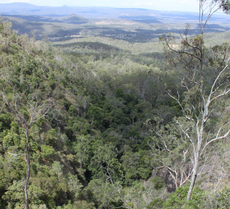
The occurrence of RE 12.8.21 often provides a cool shady patch in otherwise dry landscapes, such as this rainforest gorge surrounded by dry Eucalypt forest.