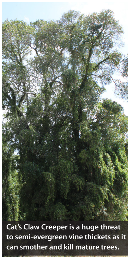
Cat's Claw Creeper is a huge threat to semi-evergreen vine thickets as it can smother and kill mature trees.