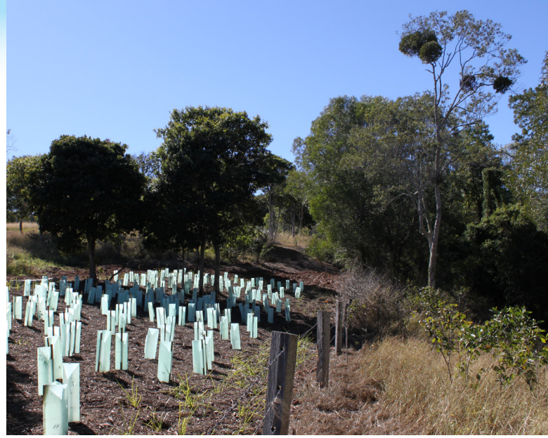
Restoration of vine thickets should focus on weed control and fire exclusion from the core patch and then gradually increase the patch size and resilience through planting or natural regeneration on the edges.

Some native species will be present and these can be used to advantage in restoration by providing a basic framework or skeleton for the project. Pioneer species can be used to good effect in restoration projects as they tend to be the fastest growing species and will assist with providing shade and reducing exposure to wind. Shade is also beneficial in reducing weed vigour. Lantana and pasture grasses will be the main weeds competing with regenerating species in more open situations. Weed control will be necessary until the developing canopy is dense enough to provide shade. However, there will always be a potential for birds and wind