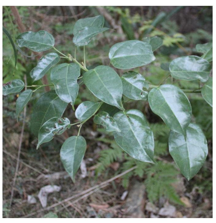
Grease Nut ( Hernandia bivalvis ) is a threatened tree that grows within patches of RE 12.11.13.

The threatened ground-dwelling Black-breasted Button Quail is a sedentary bird that lives in semi-evergreen vine thicket patches across SEQ. Softwood scrub is also a preferred roosting place for Grey-headed Flying Foxes.