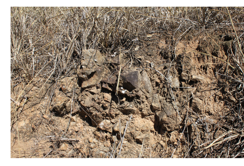
Pine Mountain along the Brisbane River at ipswich is so named for the presence of Hoop Pines that emerge above the scrubs of RE 12.11.13.

The soils and geology of RE 12.11.13 typically comprise a thin layer of red to brown loamy soil, with heavily fractured rock beneath. Road cuttings (right) and recent excavation works (above right) are a great place to see the geology exposed.