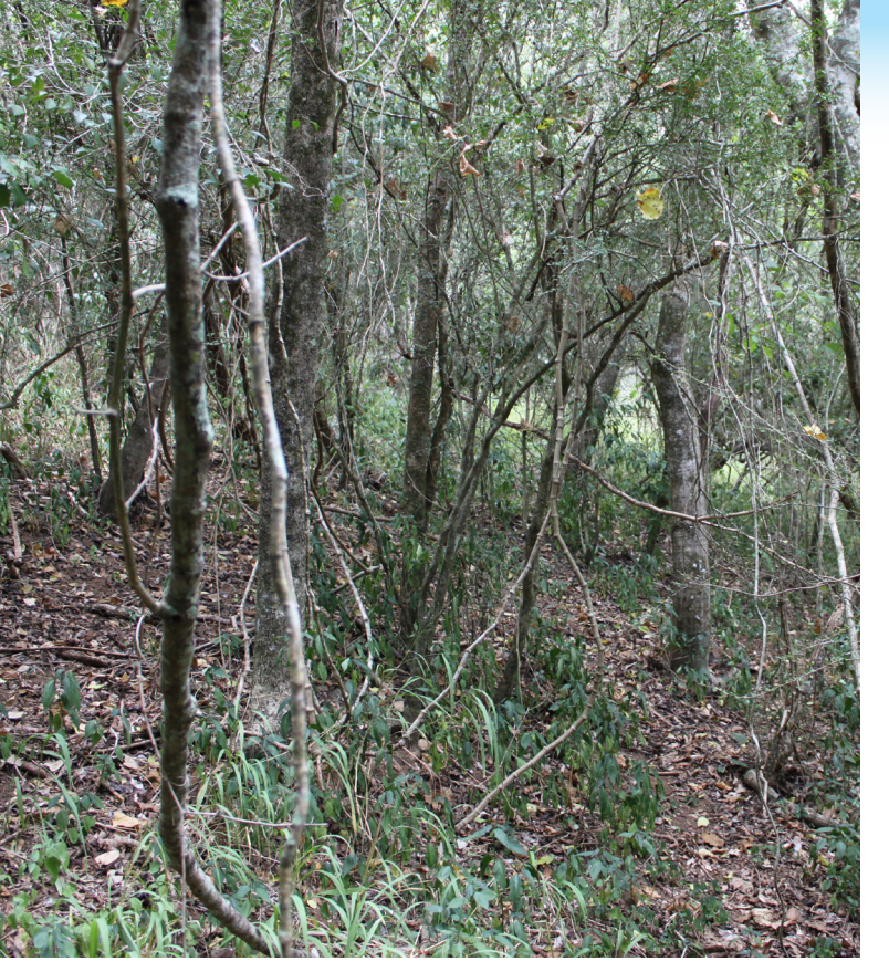
Coral Berry is a low growing weed that is commonly found in dry rainforests and vine thickets such as RE 12.11.13, as shown above.