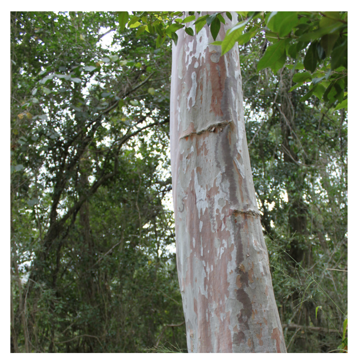
Giant Ironwood ( Choricarpia subargentea ), is a large, slow growing tree with distinctively patterned bark that grows in RE 12.11.13.