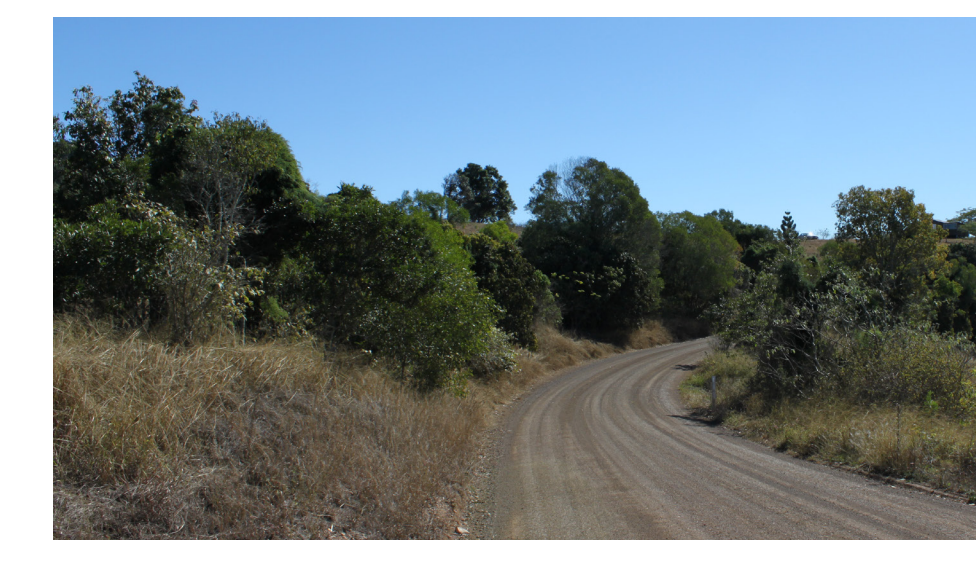
RE 12.11.13 has always had a very restricted distribution in SEQ. Today, about half of the original extent remains, with much of the remaining patches of vegetation in some kind of reserve. Remaining roadside vegetation gives a clue to the extent of RE 12.11.13 prior to European settlement.