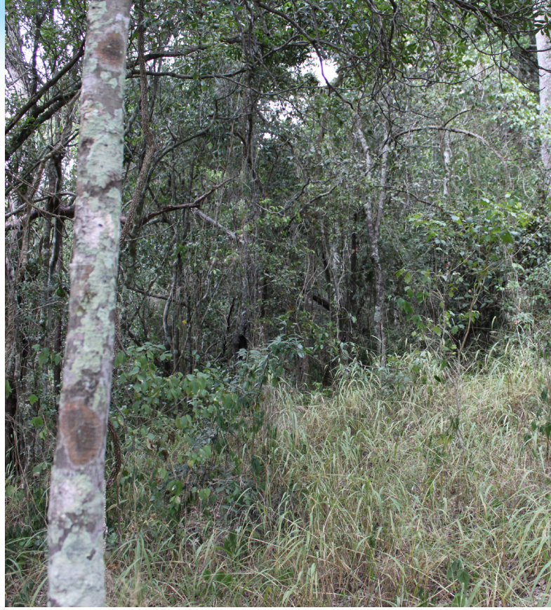
It is important to control introduced grasses such as Green Panic around the edges of RE 12.11.13, as the dry grass is highly flammable, and can increase fire intensity, which can kill the fire intolerant scrub plants.

Hoop Pine scrub patches that have been retained or reestablished in the landscape require proactive management and attention including control of weeds and exclusion of