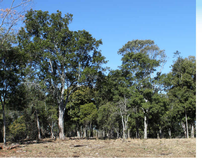
Vine thicket edges are vulnerable to weed and fire incursion, so these threats must be well managed to ensure that the health and size of the scrub is not reduced.