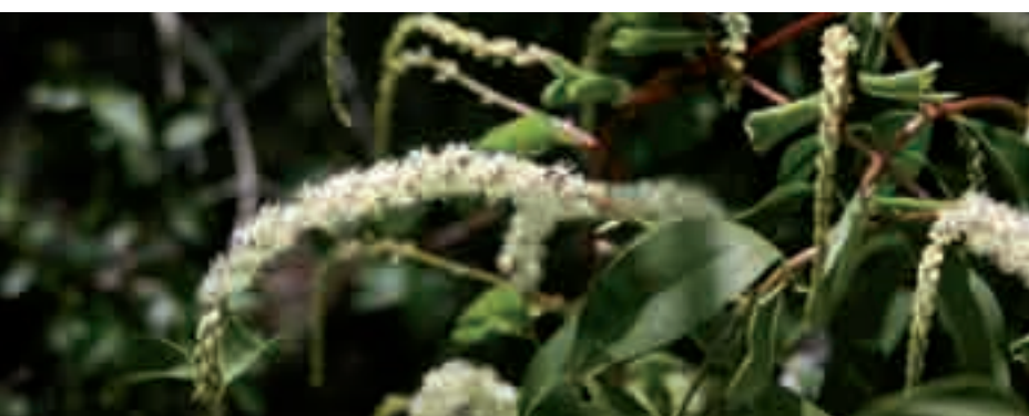
Madiera Vine is a difficult weed to control due to its aerial tubers, but combining stem scrape and manual removal has proven to be successful.

Wick applicators apply herbicide via a wick or rope soaked in herbicide from a reservoir attached to a handle or assisted with a 12 volt pump. The wetted wick is used to wipe or brush herbicide over the weed. There are several commercially available wick applicators. This method is most suitable for targeting taller plants while leaving more desirable low-growing species unaffected.