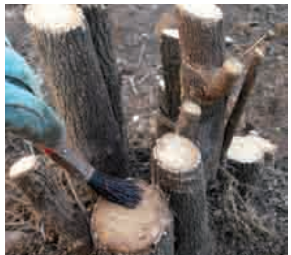
Cut stump is a very effective method for controlling a range of woody weeds. It is important to apply the herbicide within 15 seconds of cutting the stump so that the chemical is transported into the roots.

Land for Wildlife Notes are distributed free of charge to members of the Land for Wildlife program in Queensland. Land for Wildlife is a voluntary program that encourages and assists landholders to provide habitat for wildlife on their properties.