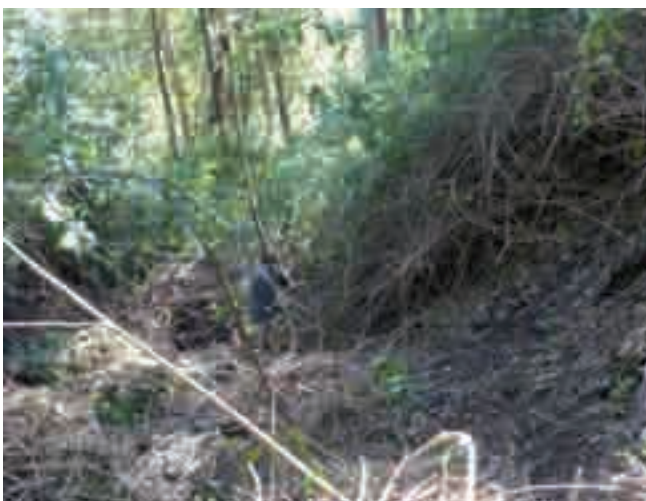
At this site shown above, lantana is being controlled manually. It is left to decompose on the ground helping form a layer of mulch to protect the soil on the steep slope.