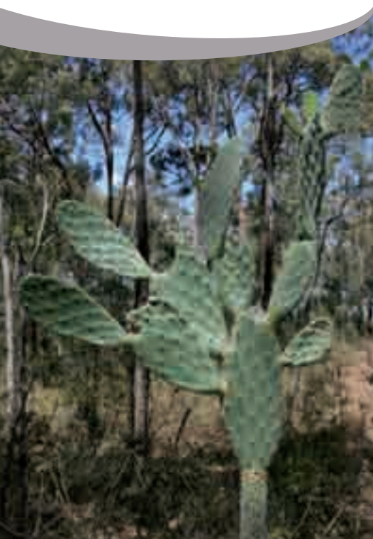
Velvet Tree Pear can be controlled by foliar spray, stem injection or manual removal.