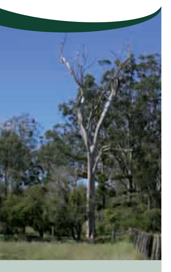
This dead tree provides nesting sites for Dollarbirds and Galahs, as well as perching and shelter sites for a host of other animals.

The age at which trees develop hollows varies widely, however, large hollows are typically associated with trees that are at least 100 years old. As a general rule as a tree becomes older, it develops more and larger hollows. Bushland areas in good condition typically have 3-10 hollow-bearing trees per hectare, each containing as many as 30 hollows of varying sizes and supporting a diverse wildlife population.