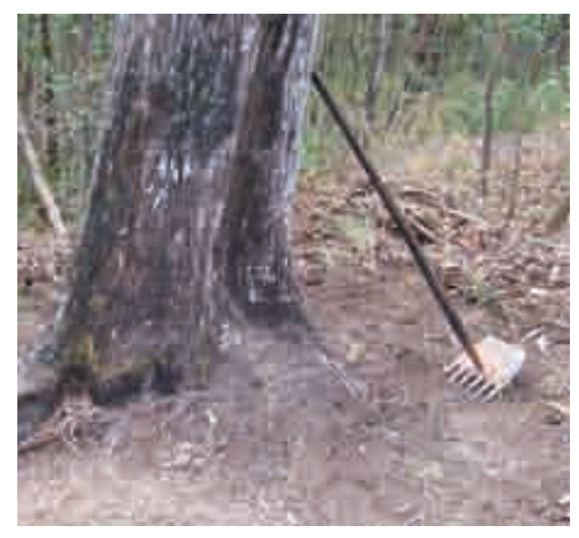
Fire rakes can be used to rake leaf litter away from the base of habitat trees prior to undertaking a prescribed burn.

Gibbons P & Lindermayer DB (2002) Tree Hollows and Wildlife Conservation in Australia . CSIRO Publishing, Melbourne.