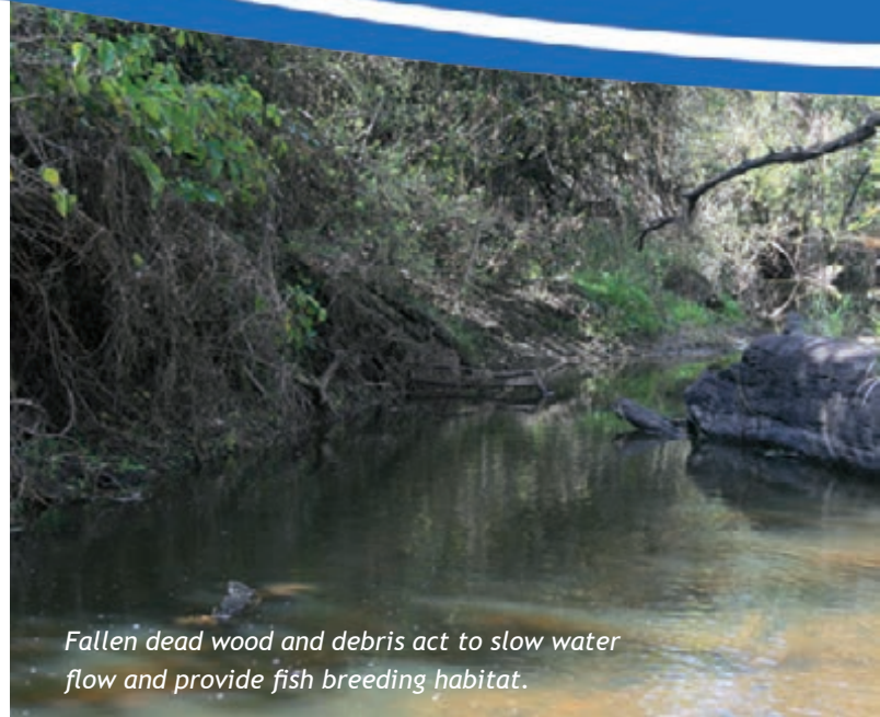
Fallen dead wood and debris act to slow water flow and provide fish breeding habitat.