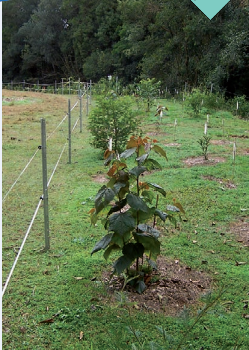
Fencing protects this riparian planting from livestock, consequently improving the water quality, and adds a buffer to the existing riparian vegetation.

Fencing the rehabilitation site and managing stock access will help minimise the impact on riparian zone vegetation. Installing off-stream watering points for stock will reduce the need for stock to access the riparian area, protecting the stream banks.